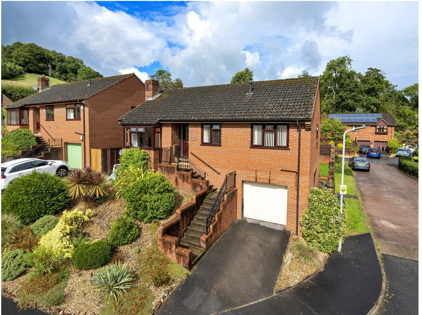
26 Ashley Rise